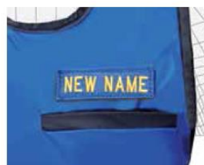
(Patch above pocket)

This flexible option has your information embroidered onto a patch. Hook & Loop on the back of the patch and on the garment secure the patch in place